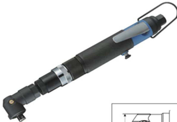
OP-5CLA08 OP-5CLA15 Rear exhaust 後排氣